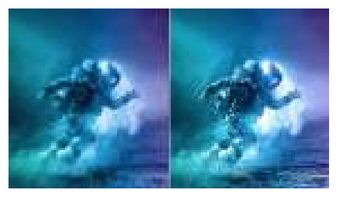
This feature is made for action-packed gameplay. Not only does it work four times

faster than a conventional VA panel, but it also pairs well with high frame rates for the utmost gaming quality at rapid speeds with sharp imagery guaranteed.