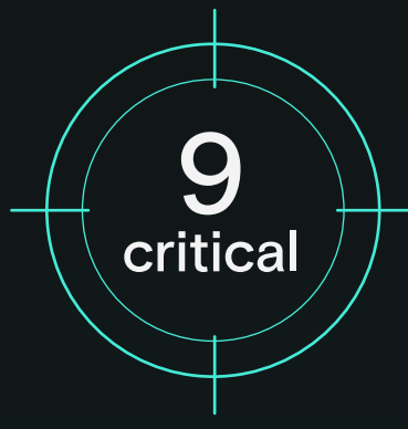
9 critical focus areas