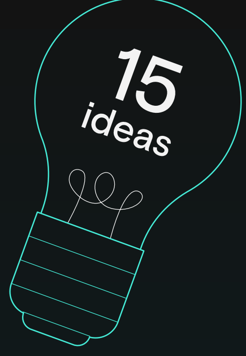
15 ideas to initially explore