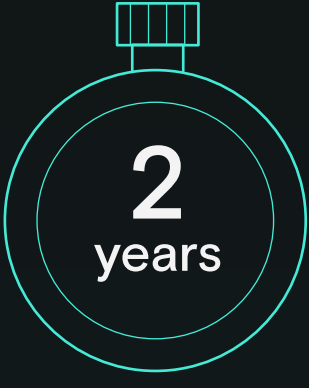
2 years of product development

Creating a true wireless and lag-free in-ear experience engineered for gaming!